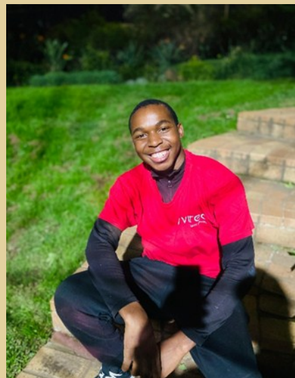
Photo of me in uniform: That is actually how great of a smile the program puts on my face.